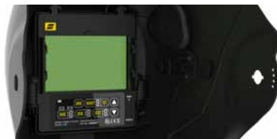
High optical class ADF, with color touch screen interface