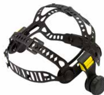
Halo Comfort 5 Point Harness (front view)