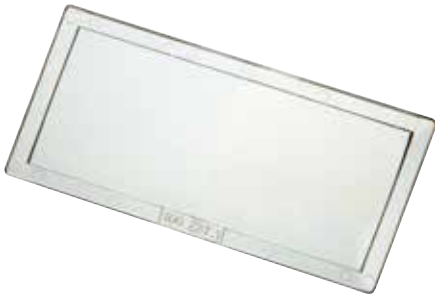
Magnifying Diopter Lens