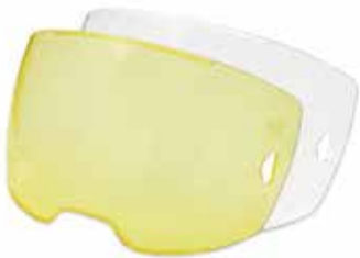
HD Front Cover Lenses