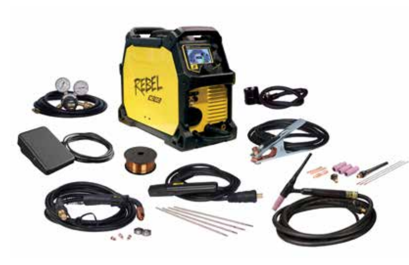
Rebel EMP 205ic AC/DC and accessories.