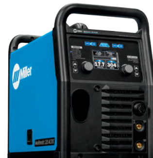
Multimatic 220 AC/DC