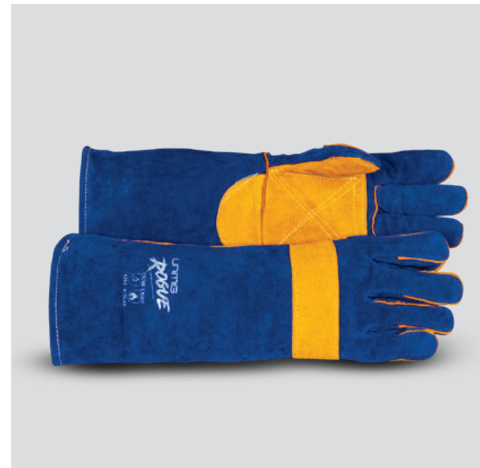
ROGUE MIG WELDING GLOVES