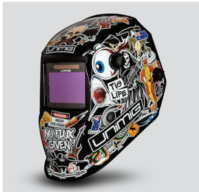
CHAOS WELDING HELMET