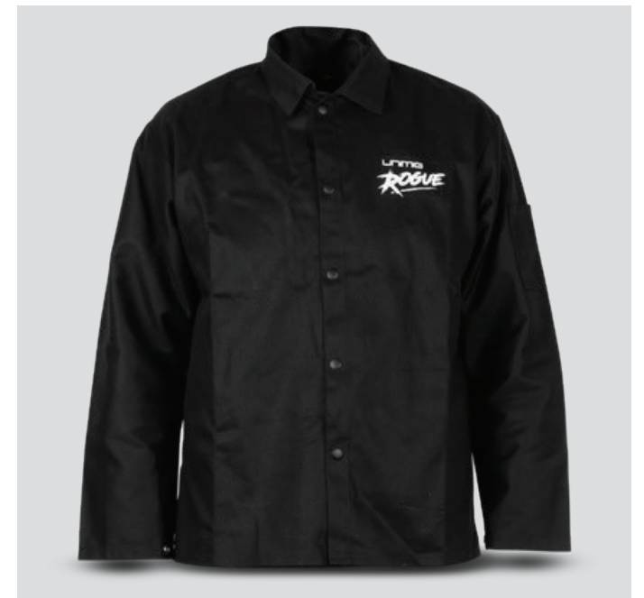
ROGUE WELDING JACKET